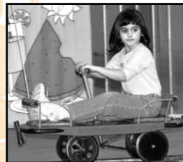
Ottawa Pump-its circa 1940's The Ottawa Pump-its are self-propelled around the track by the pumping action of a "T" bar which is mounted in the middle of each handcar.

Two similar, but uniquely different sets of handcars