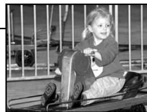
Hodges Handcars circa 1950's The Hodges' Handcars are self-propelled around the track by the rotating action of hand pedals which are mounted in the middle of each handcar.